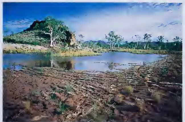
Figure 3. A semi-permanent waterhole located in the bed of the Finke River, near its source, 3 km upstream from Glen Helen Gorge, Northern Territory.

In the low lying regions of central Australia, water-courses scour out coarse bed material during rare floods, and quite large holes may be formed, especially where